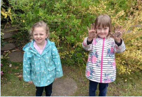
Little Owls 1 during their Forest School session

This week has seen a fantastic array of activities and learning across the school. Year 3 and 4 children have been learning all about the River Nile, creating engaging non-chronological reports as part of their exploration into Egyptian history. Meanwhile, in Year 2, our budding artists have been developing their observational skills by creating stunning drawings of pineapples. In Year 1, children furthered their mathematical skills through a series of challenges, while in Little Owls 1, there was a lot of excitement as they had their first ever Forest School session.