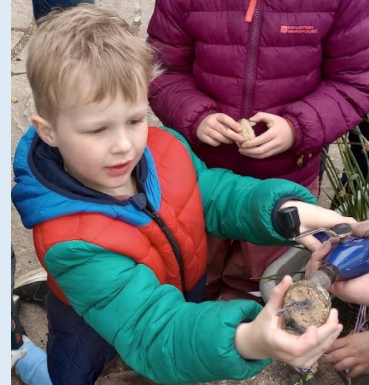
Children in Year 3 and 4 have had great fun Den building at playtimes!