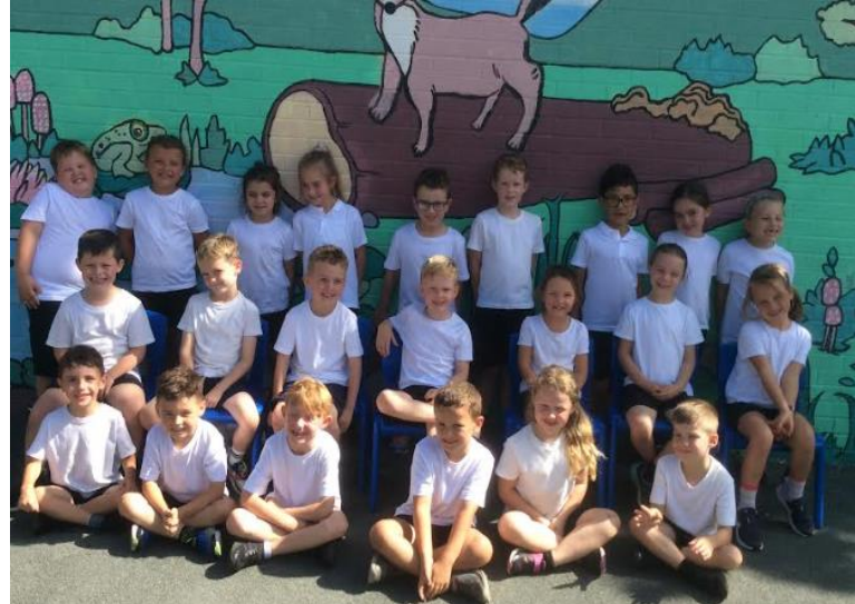
Tawny Owls 3 (Year 2)