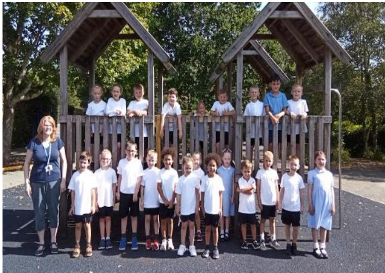
Tawny Owls 2 (Year 2)