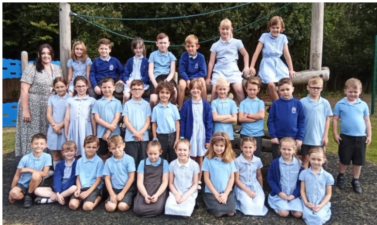
Snowy Owls 1 (Year 3 and 4)