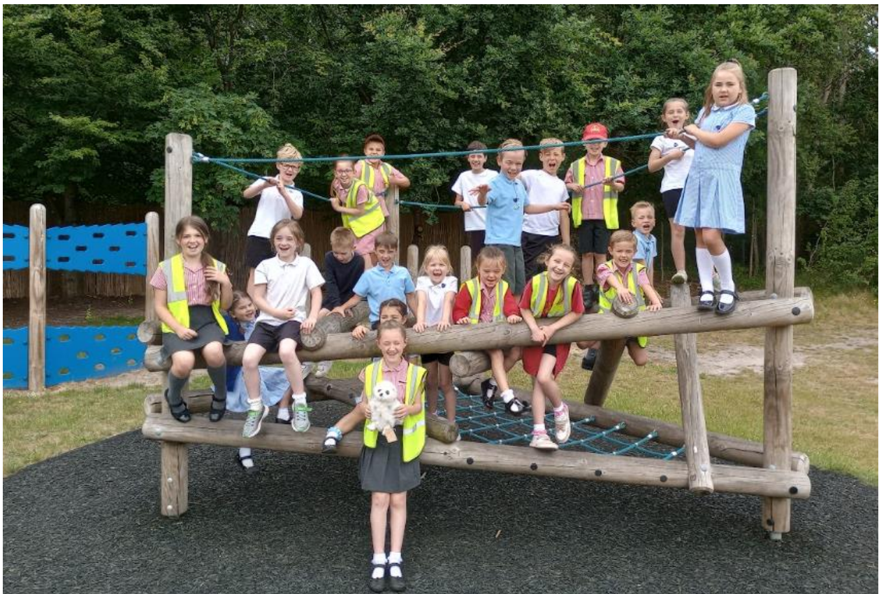
Members of Hillside First School's School Parliament and Verwood First School's School Council

Overall, the joint School Council meeting between Verwood First School and Hillside First School was a resounding success. The event not only facilitated meaningful interactions between the children but also provided a platform for future collaborations and exchange of ideas. The exceptional conduct displayed by all children was a testament to the values instilled in both schools, and the event served as a springboard for future working together between the two schools.