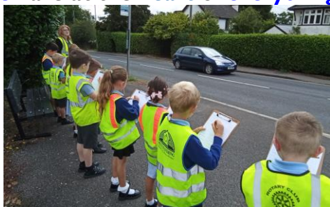
Some children from Year 1 and 2 taking part in their traffic survey

'Where children are at the heart of everything we do'