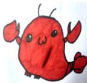
Larry the Lobster of LIBERTY We are free to make choices.