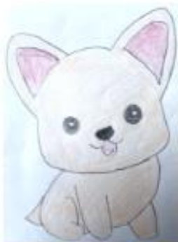
Daisy the Dog of DEMOCRACY Our opinions matter in school.

It was important to choose friends that will speak up for what's good for all of us.