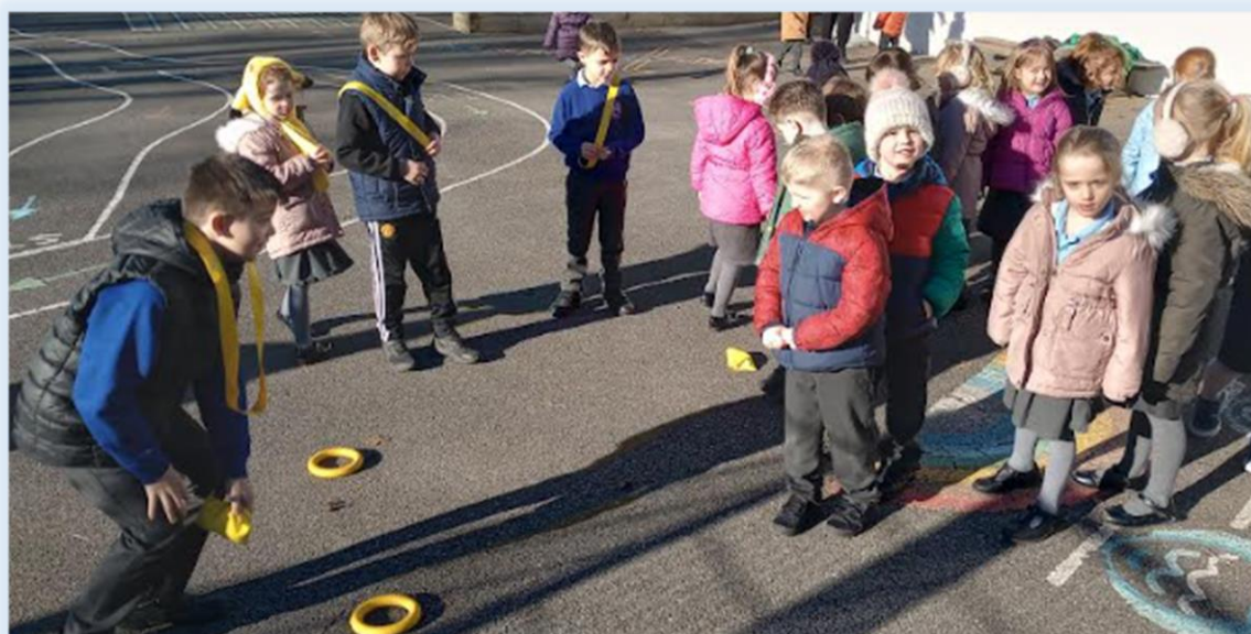
Some of our Year 3 and 4 Play Leaders supporting children from Little Owls during lunchtime play this week.