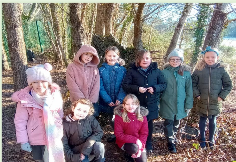
The 'Camping Crew' have been making the most of our outdoor space this week and have been enjoying building dens at playtimes.